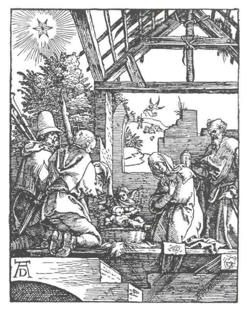
The Nativity, 1510 German woodcut by Albrecht Dürer